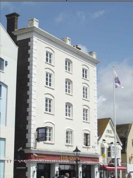
Parapet wall detail