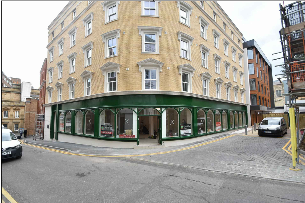
Shop frontage example (Albert Road, design by ARC)