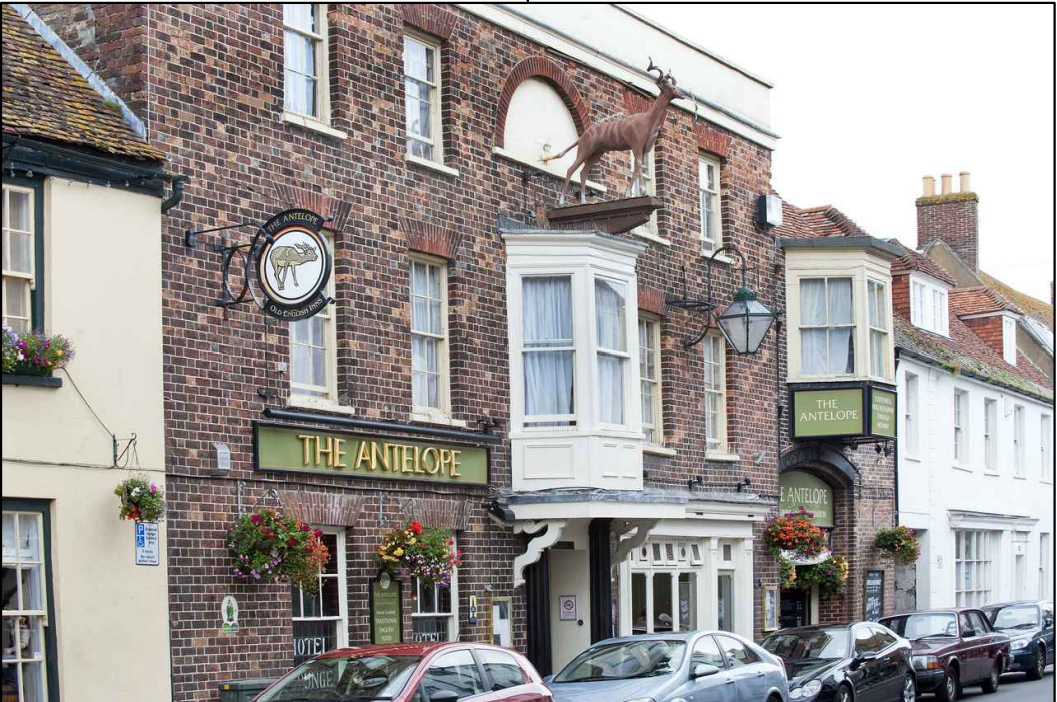
Rubbed brick window head detail